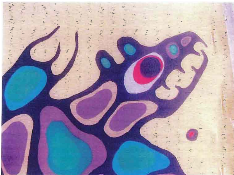
Portions of the 002-b painting