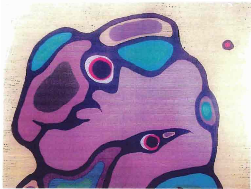
Portions of the 002-a painting.